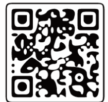
FOWL APP QR CODE (A)

Need more help to set up and check out all the fonctions of the camera and the App: Watch our video and download the full app documents on our website: www.tokktech.com or call us and we will be very happy to help you. Our phone number is +1 858 999 2114 ext 1